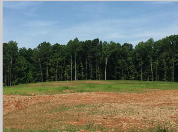
One of the recently graded lots is Lot 4, located at the end of the cul-de-sac on East London Drive. It is 24+ acres with 10 acres graded.

Bedford County Office of Economic Development