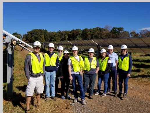
BCPS students learned about solar energy at the Bedford Solar Farm.

Following the tour at Sam Moore, the students visited the Solar Farm in Bedford. The Solar, Farm is operated by O2 EMC, out of Charlotte, NC, provide energy to the Bedford.. The students really enjoyed this tour and learned about solar energy and all of the career pathways in this industry, from finance to business development, and legal to engineering.