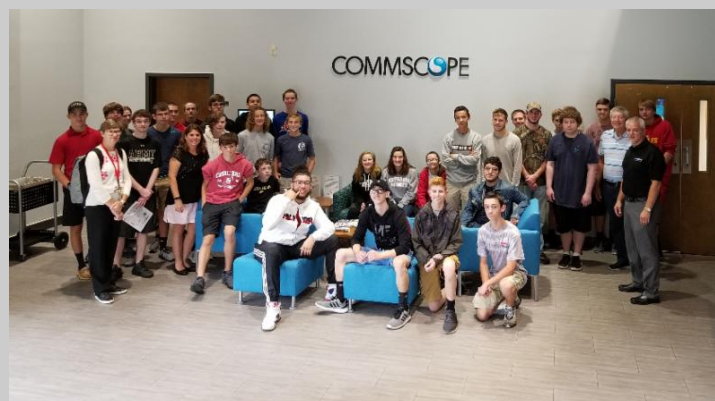
BCPS students tour CommScope in Forest.

Bedford ONE (Offering New Experiences) started the 2018-19 school year with tours in Forest and Bedford. Students from Jefferson Forest High School who are enrolled in an engineering technology class had the chance to tour two manufacturing companies in Forest on Tuesday, September 11. At CommScope, the group of 30 students learned about connectors for cellular towers that allow for more calls and data usage to