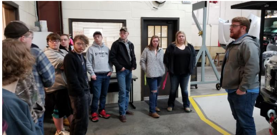
BCPS students tour Custom Truck One Source.

Custom Truck serves the forestry and power industries among others, and customizes vehicles such as bucket trucks that can be used to trim trees or work on power lines.