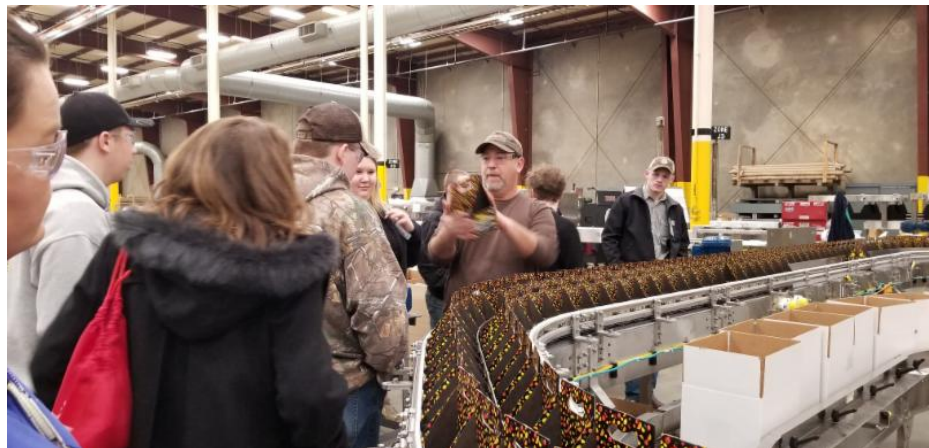
Students at Sentry Equipment watched conveyor systems in action.

At the end of the tour, students were treated to a pizza lunch by the company and watched an Ultimate Factories video that features Sentry Equipment in the Coca-Cola bottling plant in Louisiana.